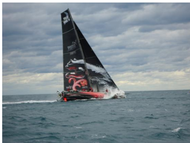
Team Puma charging past