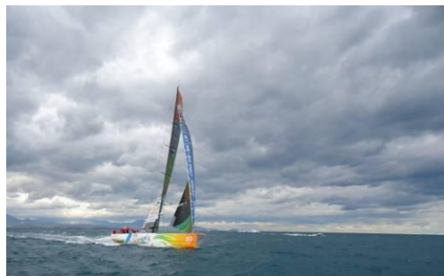
Team Sanyo coming up astern

Next morning we continued up the coast to Villajoyosa and the next day we started back and spent the night at Puerto de Campello where we spent the evening having a meal at the home of one of my Spanish crew. Next morning it was blowing 25mph and the forecast was 20-25 so we set off to Alicante to watch the start of the Volvo Ocean Race. It didn't take long for the wind to get up to 30+ and rounding the point into Alicante bay it was up to 36+ and some smaller yachts gave up trying to follow. We sailed around the bay and watched the start of races from a distance and