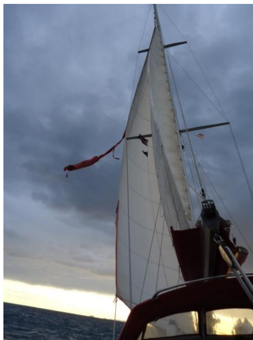
Genoa edge strap adrift

Nigel Collingwood Rear Commodore Cruising