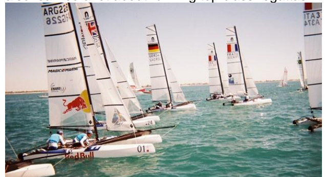
One minute to the start and you can almost feel the concentration from the crews