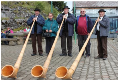
That's not a Clarinet, how do you expect me to play that?!