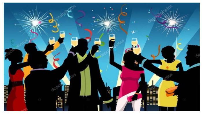
Join our WhatsApp Group to keep up to date with forthcoming Club events