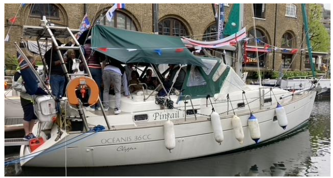
An overloaded Pintail in the rain ....

The fleet started to head for home from Sunday after Coronation Day, Blown Away together with Fox out the Box and Happy departed the lock at 6.45am Wednesday for Ramsgate. The seas were calm, we had sunshine nearly all the way and we arrived 10 hours later with suntans.