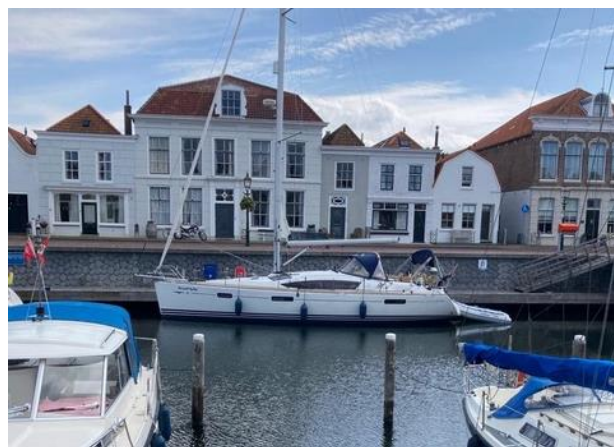
Blown Away in Browenshaven