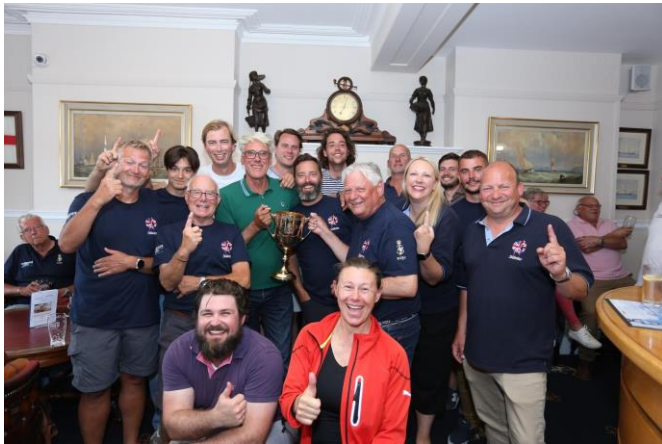
Griel and Stiletto crews together Just one second separated them for the Gold Cup.