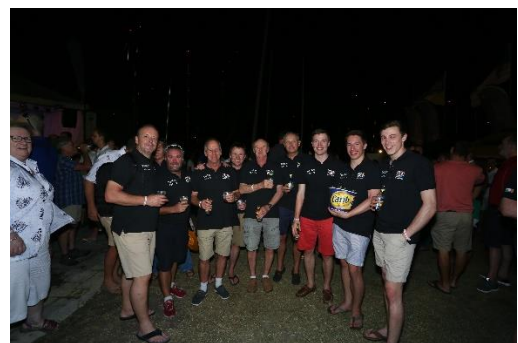
2018 C600 crew