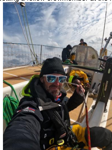
Carrying out running repairs