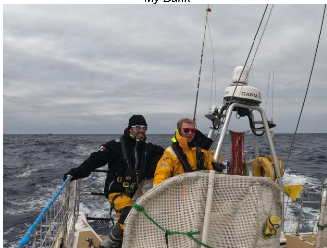
Spotting a fellow crewmember at the helm