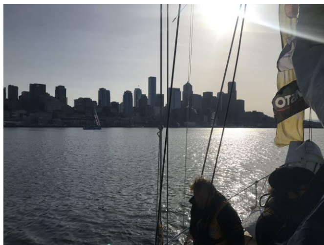
Arriving into Seattle