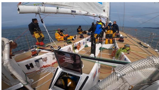
Crossing the finish at Cape Flattery