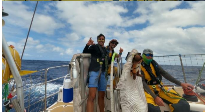
Pre-Race Start, Luzon Strait