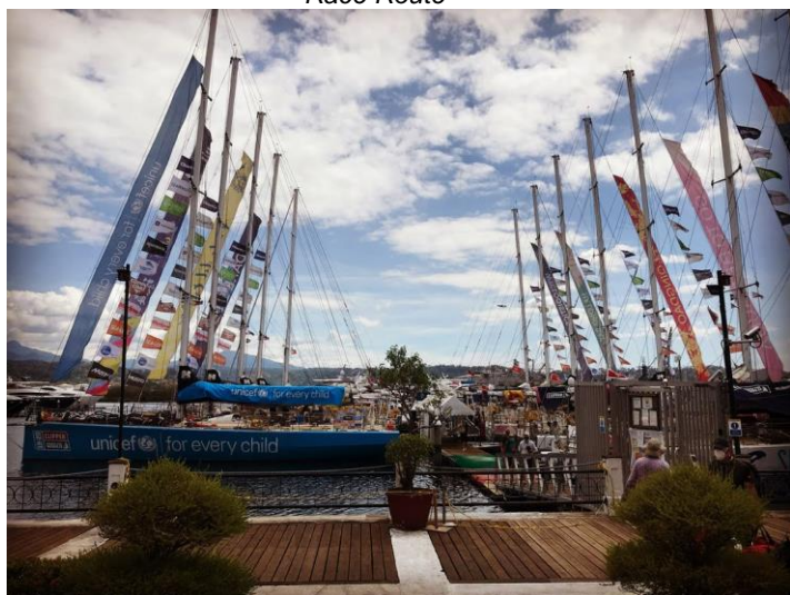
Fleet in Subic Bay, Philippines