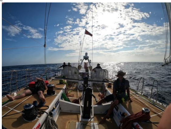
Leaving the warmer conditions of the tropics