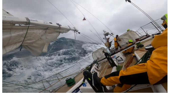
Storm force winds, and big seas south of Japan.

The next 48 hours were brutal, and perhaps some of the toughest of the whole race. The sea state became very confused with 3–4- meter waves and consistent 30 – 40 knot winds. We had to steer away off the crests of the waves in an effort to prevent the boat crashing into the troughs below which contributed to a very poor tacking angle and made for very slow progress but saved the boat and crew from any further damage. I suspect that some of the fleet may not have been so careful, with one boat having to detour to Japan to evacuate an injured crewmember and another yacht, Qingdao , later reporting serious damage to a check stay which forced them to divert to Yokohama for repairs.