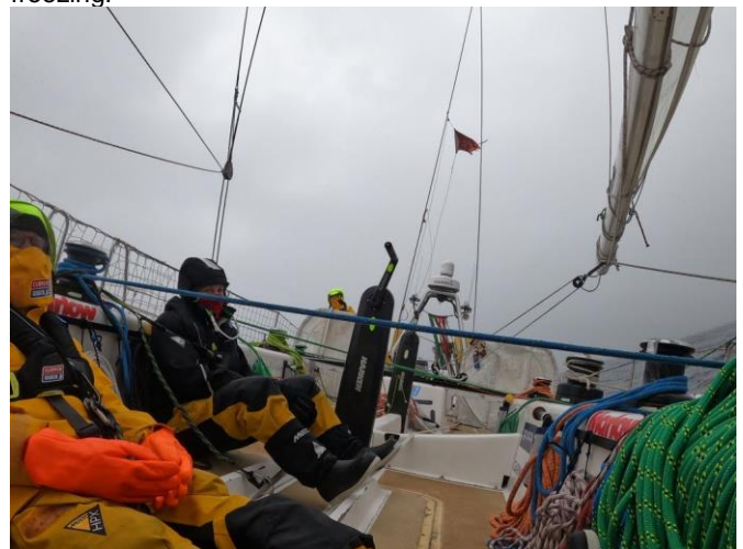
Freezing conditions NE of Japan

The storm had taken it out of us, but the team were still in good spirits and once past the islands directly to the south of Yokohama we started to make good progress north with the breeze moving gradually West. Soon we were on a beam reach, making 11-12 knots and enjoying the last of the Kuroshio current as it pushed us ever farther north. As we did the conditions grew increasingly cold. Prior to the start of the race, we had studied weather data for previous years and determined that a northerly route would offer favourable conditions. Some of the other teams had made no effort to hide their intentions to stay further south in more mild temperatures and it took courage to stick to our guns. Soon we found ourselves alone but for the occasional pod of humpback whales, some 350 miles away from some of the fleet. I remember coming on deck one morning to the sight of freezing fog with occasional flakes of snow falling on deck – it was freezing!