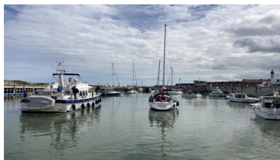
The Fleet leaving Bassin Quest for Ramsgate and Gravelines

On Sunday afternoon many of the RTYC contingent took advantage of the excellent free Calais did the Town Hall Tour. Monday morning saw the fleet leaving for home.